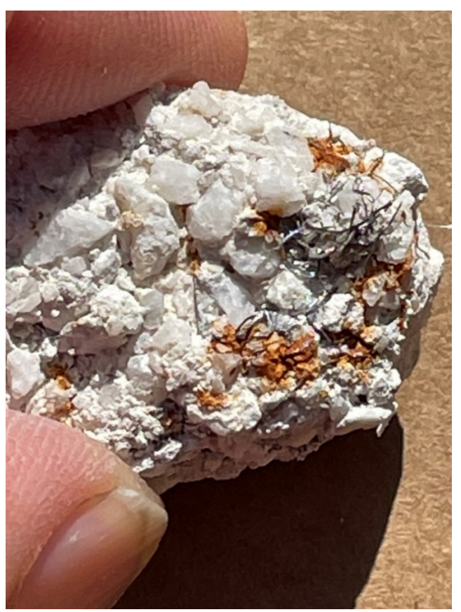
Figure 3 – Native Wire Silver in Drill Core