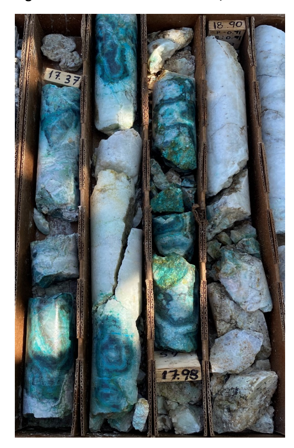
Figures 2 and 3. Drill hole CK21-01, 3 Native wire silver within quartz carbonate grains in hole CK21-01.

Drill holes CK21-03, 05, 07, 08 and 09 are omitted as they had no significant mineral values. Estimated true widths range from 70% to 90% of the reported intervals. Coordinates and identification drill hole data are in Table 2 at the end of this release.